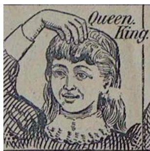
Queen/King, Ash, Guide to Chirology (c.1888), p.6.