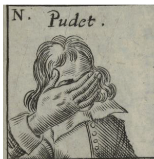
'He is ashamed', Bulwer, Chirologia (1644), p. 155