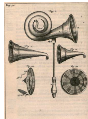
18th-century ear trumpets.

There wasn't this kind of concentrated activity in 1660s London, but evidence shows deaf people signing fluently with family and friends. Some were living close to one another, especially in Westminster. There's also evidence of hearing tutors who spread information about deaf communication, particularly fingerspelling. It's very likely that some of the deaf people in London were exchanging signs and refining the methods of communication that were available in print.