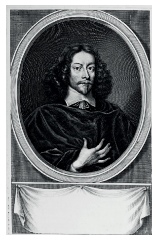
John Bulwer. Line engraving by W. Faithorne, 1653.