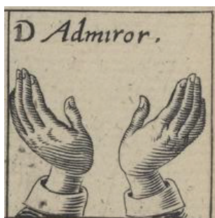
'I admire', Bulwer, Chirologia (1644), p. 151