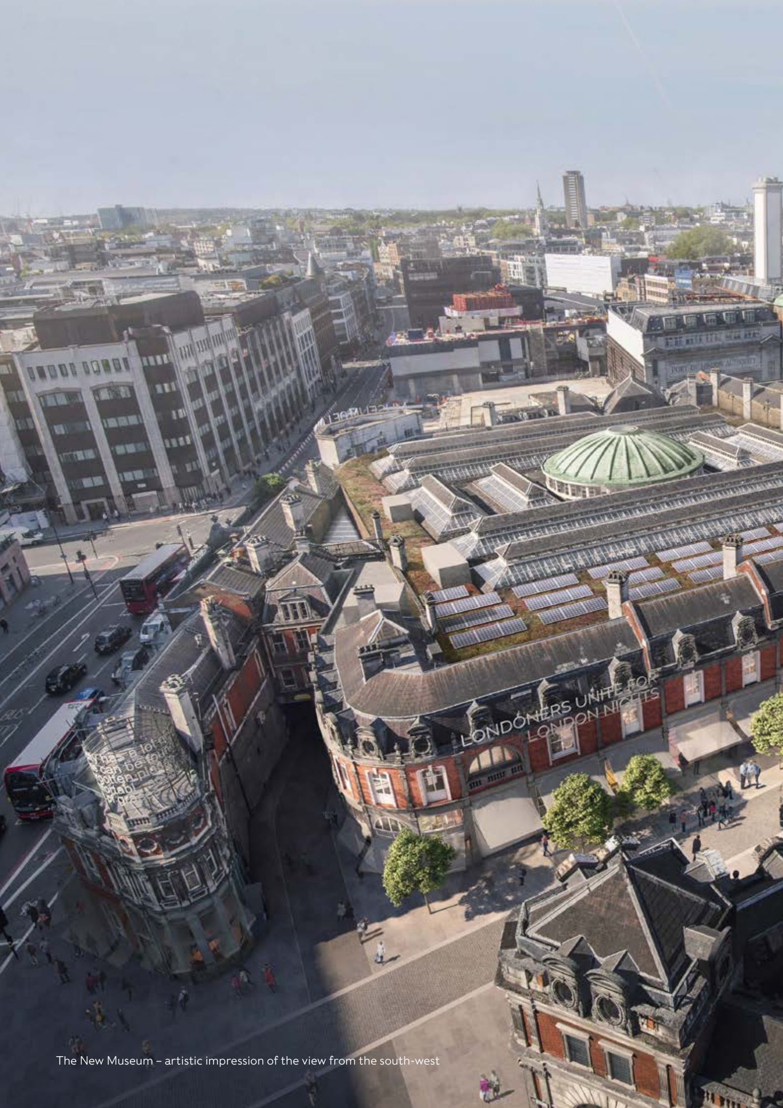
The New Museum – artistic impression of the view from the south-west