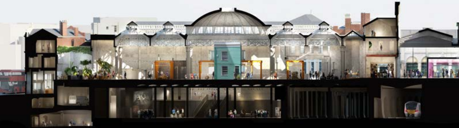
Artistic impression of the layered new museum